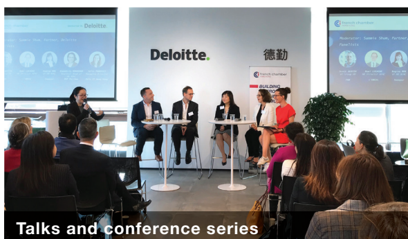
Talks and conference series