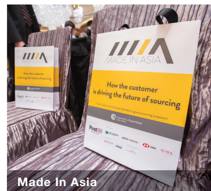
Made In Asia