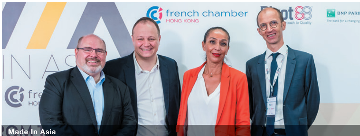
Made In Asia