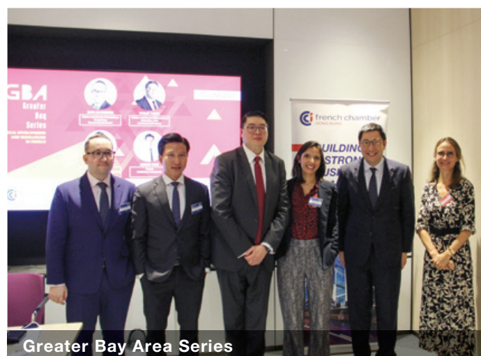
Greater Bay Area Series