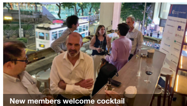
New members welcome cocktail