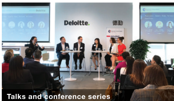
Talks and conference series