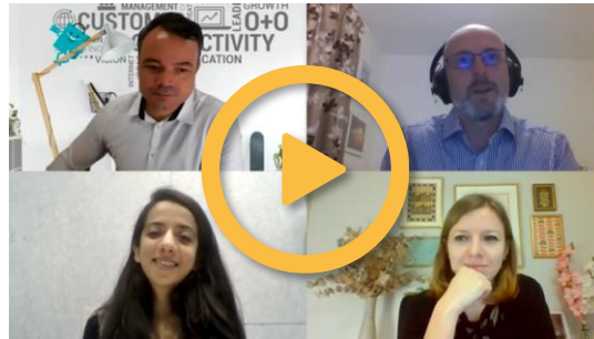
Food and consumer goods