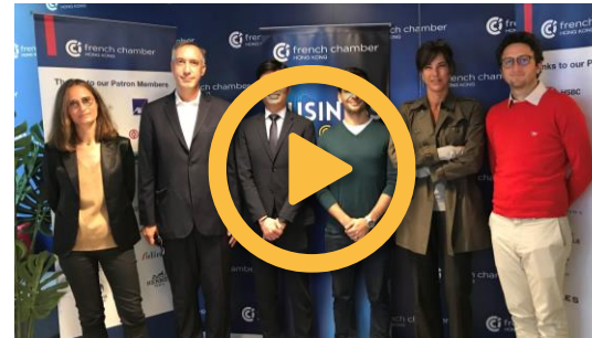
Responsible consumption and production