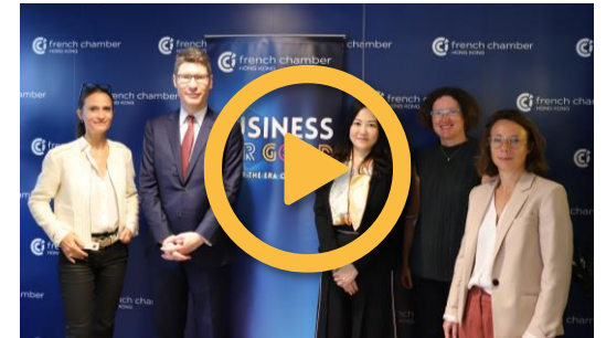
Finance goes sustainable